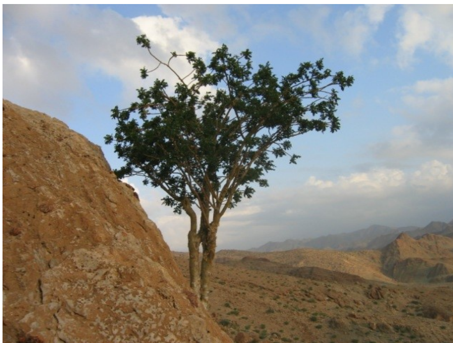
One of the source trees for Boswellia frereana resin

A superb anti-inflammatory and revitalizing scent, Boswellness Frereana Essential Oil contains no synthetic or chemical ingredients. Just pure distilled essential oil with the health and mood benefits of frankincense.